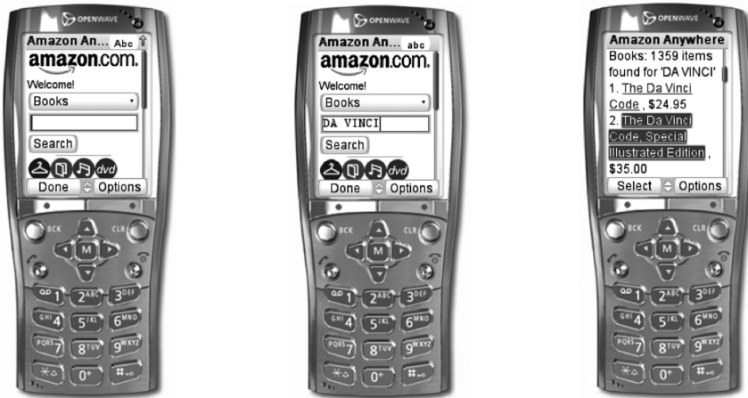
Figure 2. Screenshots of Amazon Anywhere, M-Commerce Site

from McKnight et al. [58], Montoya-Weiss et al. [61], and Wang and Benbasat [86]) was used to measure system quality attributes of the user interface, the level of trust that each participant placed in the simulated IT artifact, and user intentions to adopt the m-commerce portal as a means of purchasing.